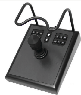
• M7626-N84-13xxx (RS-485 Serial Joystick w/12 Switch Keys)