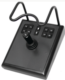
• M74U4BR-N33-M4151 (Industrial Mouse w/ 8 Function Keys)