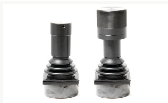
• Open Frame N82 , N84 , Industrial Analog Joysticks