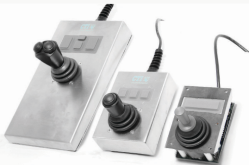
• M90U9-N34 , M20U9-N3 , H20U1-N24 Mouse Pointing Devices