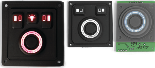
• Open Frame OM2200 , OM20U2 , OM2000 , Button Style Mouse