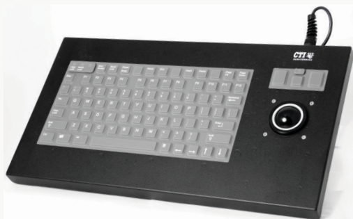
• Plug-n-Play KIT24U1 Industrial Keyboard | KIT34U1 Rack Mount