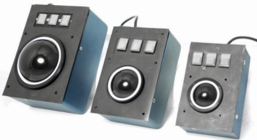
• T40U3 , T10U3 , T70U3 Panel Mount Trackballs