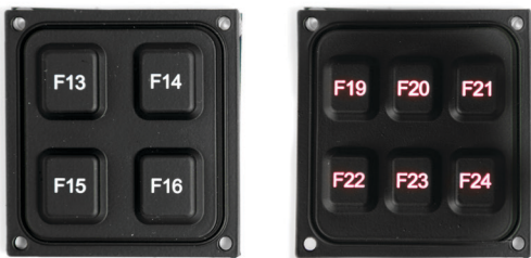
• Open Frame KP40U4 and KP60U6-BR USB Keypads