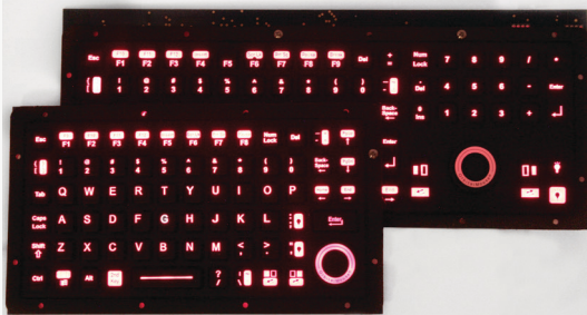
• Open Frame KIO68U4-BR , KIO78U4-BR Illuminated Keyboards