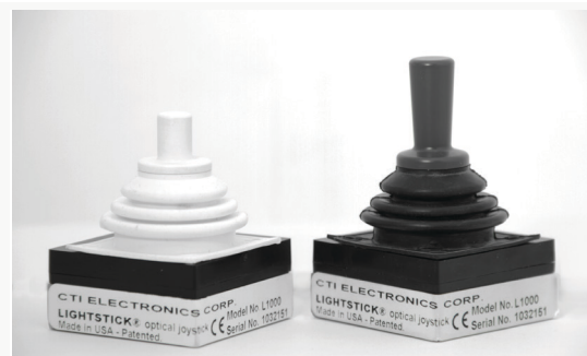
• N2W Medical Lightstick® , N24 Industrial Lightstick®