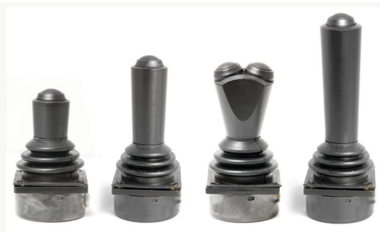
• Open Frame N3 , N33 , N34 , N63 Industrial Analog Joysticks