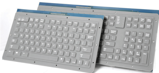
• Open Frame KI88U1 and KI98U1 Industrial Keyboards