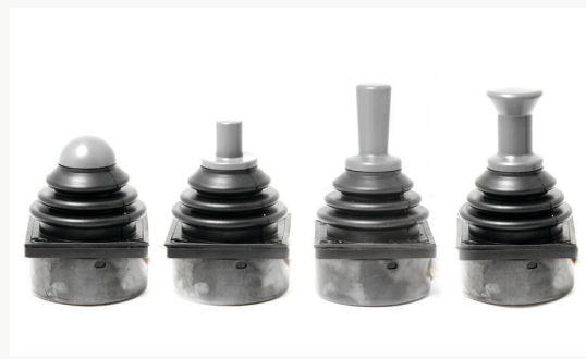
• Open Frame N5 , N2 , N24 , N54 Industrial Analog Joysticks