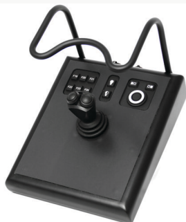
• M76U8-N34-T6102 (USB Flightstick w/ OrbitalMouse®)