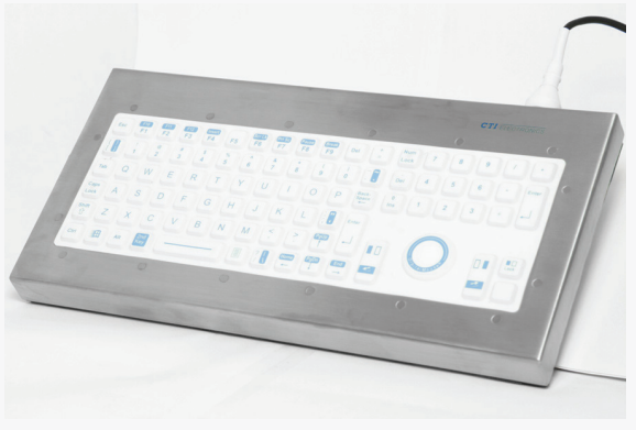
• Shown above KIO76U6 Medical Keyboard with OrbitalMouse®