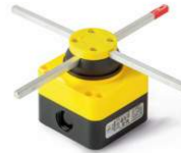
FFH Internal cam switch P016 line